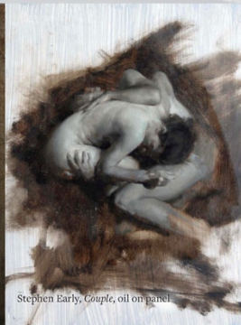
Stephen Early, Couple , oil on panel